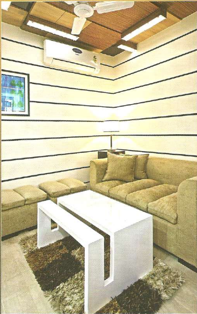
the light fixtures, casting a series of shadow pattern.